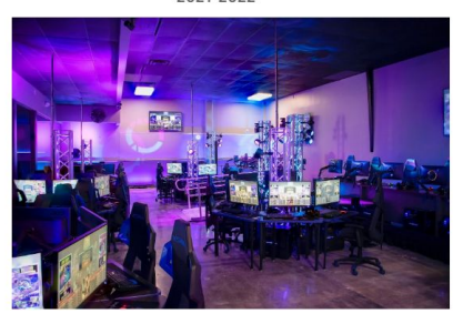
By: Kooper Vosburg